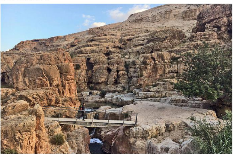
Wanderung durch das Wadi Quilt unweit von Jerichov: Nach der Tour gibt es in einem Gästehaus ein palästinensischen Imbiss.